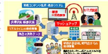
Generating broadcast contents by Web scraping and mashup.