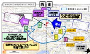
Estimation of viewing area with antenna direction.

Area broadcasting TV is beneficial as a local information transmission medium because it can be viewed simply by pressing a channel button on the remote control with a home TV receiver. However, the production of broadcast contents takes much time and effort to gather broadcast materials and perform video editing work. Broadcast audiences want to obtain regional information in a timely manner. To realize that goal, it is necessary to devise a method of generating new broadcast contents. This research is based on the fundamental concept of placing information material on the PC screen and using the screen as broadcast contents. Multimedia processing is applied to various information materials acquired from the network. Furthermore, it sequentially maps them to frames of the previously designed broadcast screen image. As a result, it is possible to generate broadcast content that changes over time.