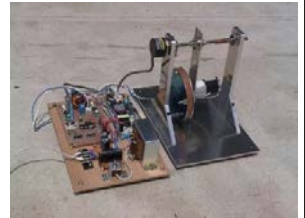
Fig. 1 Swing type inverted pendulum.

Stabilization of an inverted pendulum with the rotor is basic control as a posture control robot ASHIMO. However, an inverted pendulum with a rotor stands the pendulum using the reaction force generated by giving torque to the force point. Our purpose is mainly realizing the swing control.