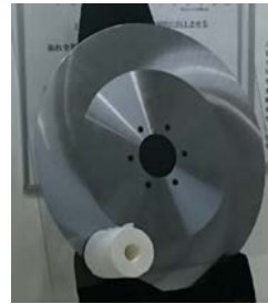
Fig. 1 Log saw blade .

[Seeds: Materials processing for commercial steels: (quench and tempering, nitriding, laser processing)]